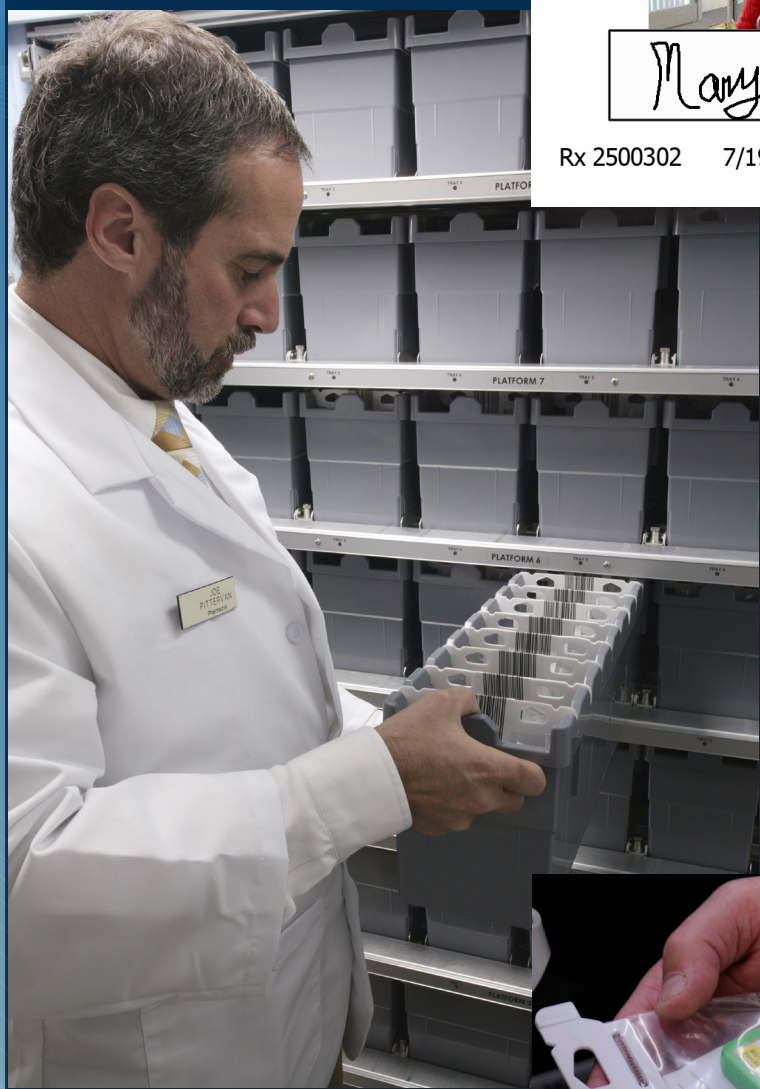
Photo & signature capture